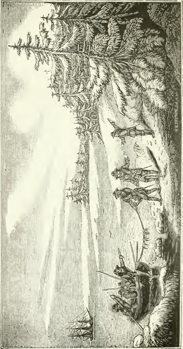
Landing of the Pilgrims at Plymouth, December 22, 1620.